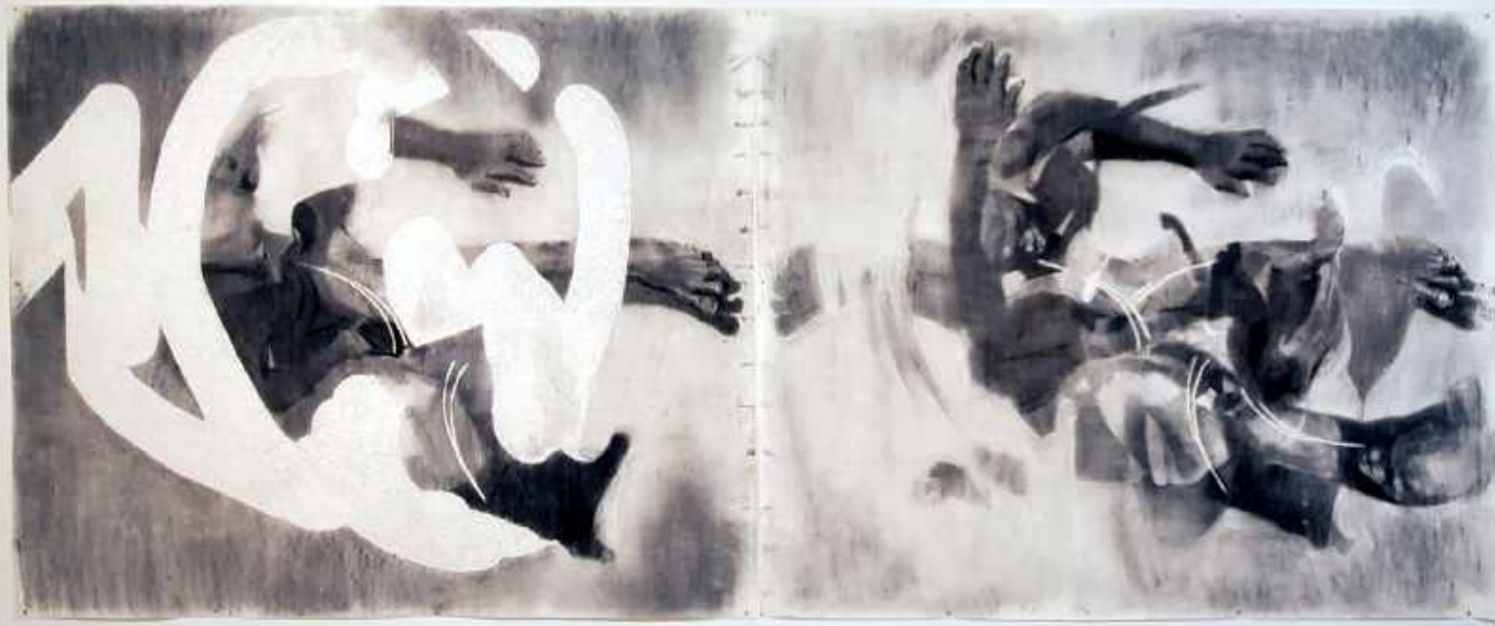
Keloid Drawing #1 and #2 . Charcoal on paper .53"x144. 2015. Courtesy of the artist and Anat Ebgi Gallery.

in my audience. I could be showing in Norway and someone from Jamaica comes to see the show and just get it.