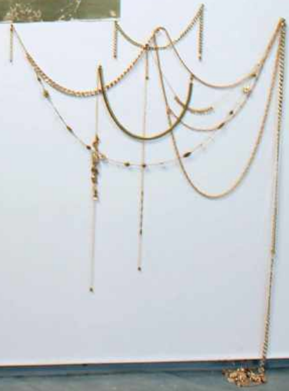
No Longer Yours . Charcoal and mixed media on paper, 50" x 76". 2019.