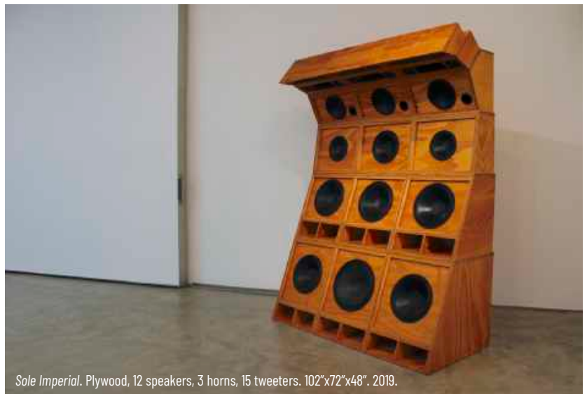
Sole Imperial . Plywood, 12 speakers, 3 horns, 15 tweeters. 102"x72"x48". 2019.

This is how Whyte views Sole Imperial : “This speaker system is not an actual cultural artifact, it is a simulacrum. By creating a representation, I am engaging in an ongoing reconciliation between cultural memory and cultural identity, and the reality of my personal change due to my own migration.” ■