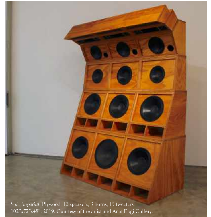
Sole Imperial . Plywood, 12 speakers, 3 horns, 15 tweeters. 102"x72"x48". 2019.

In Nocturne in Blue and Gold , Whyte's use of photography conveys his attention to reinterpreting images and a deeper analysis of carnival in contemporary culture. In this case, he reconsiders a real carnival image to create a work imbued with mystery and political implications. The people of color that appear in the drawing, who were inspired by the original photograph of a real life event, engage in carnival to express their culture freely without police or social oppression. The drawing creates a conceptual parallelism between the origins of carnival and its contemporary manifestations, specifically in Black communities. With origins in Africa, Europe and Southeast Asia, carnival emerged in enslaved Caribbean communities